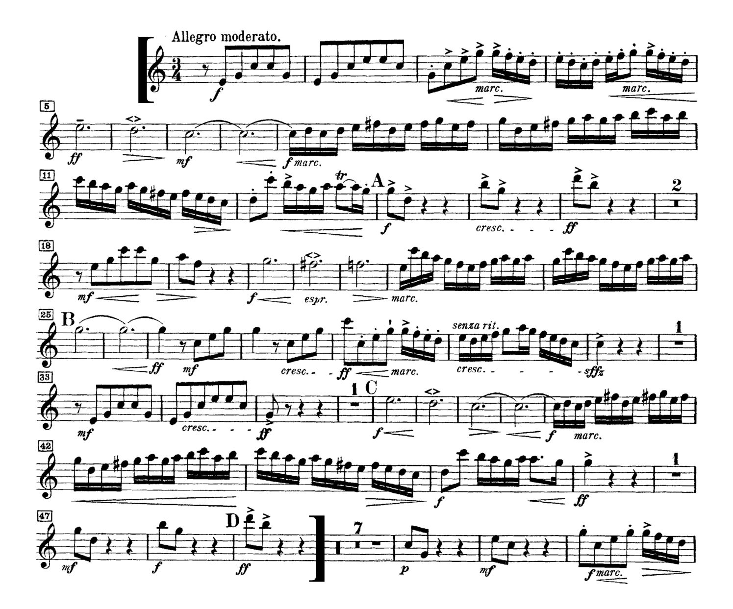
- No. 1: Beginning – mm. 49