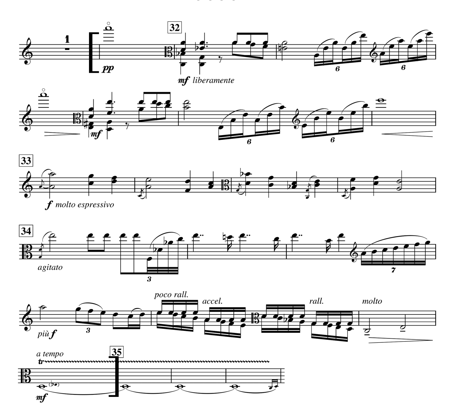
Variation 5: 1 before [32] - [35]