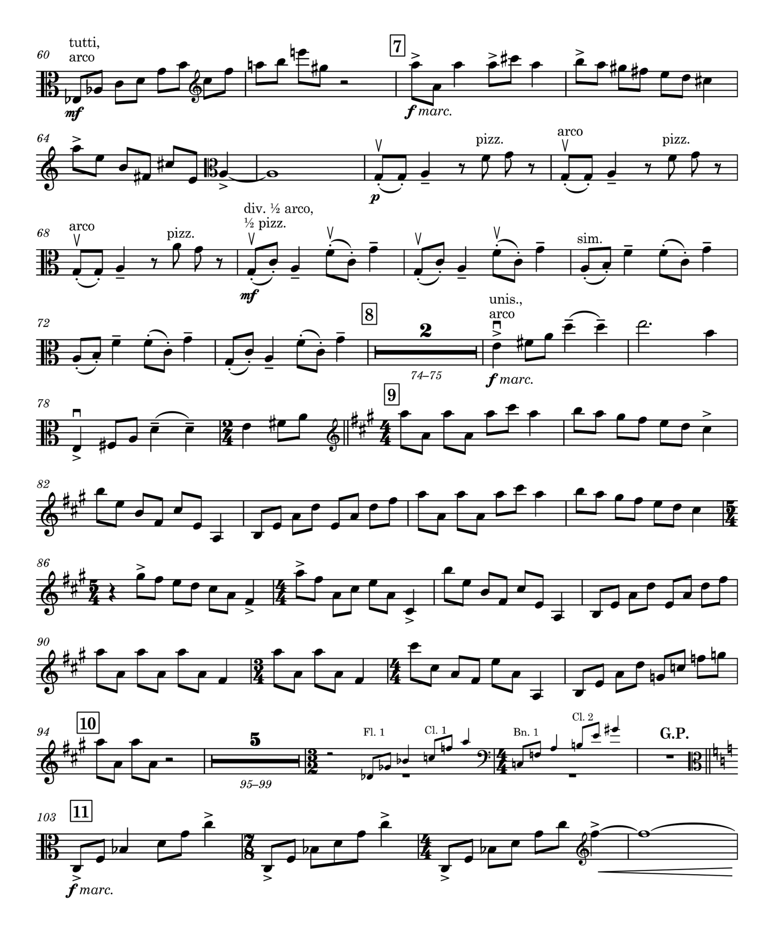
Copland Suite from Appalachian Spring (full orchestra version) (continued) [6] - 1 before [14]