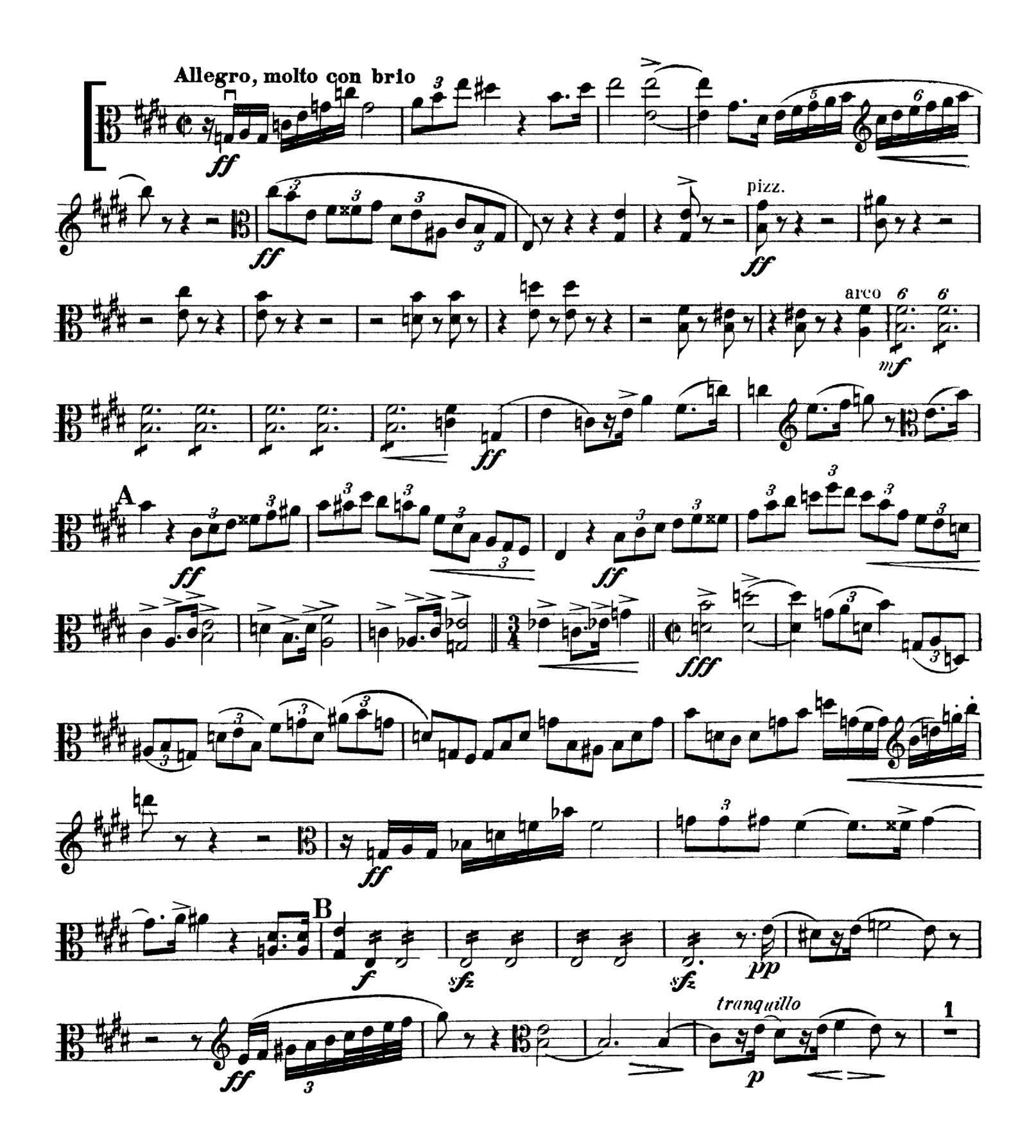
Beginning - 5 before [D], including pizzicato